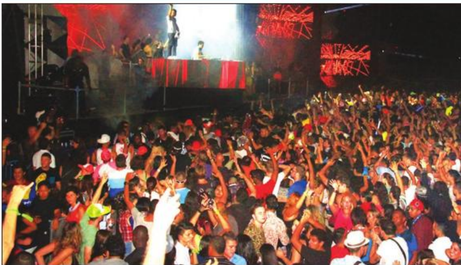
A shot of Aruba's 1st Electric Festival

Among the droves of motivational speakers, invited to Aruba to present at various events, particularly among those addressing the tourism industry and marketing, a very clear message is oft repeated, "continuing to rely on the methods of last year's successes will leave you a year behind the competition." This message was also brought forth by the guest speaker at the World Tourism Day observance conducted by Aruba's tourism marketing entity, the Aruba Tourism Authority, (ATA) last week.